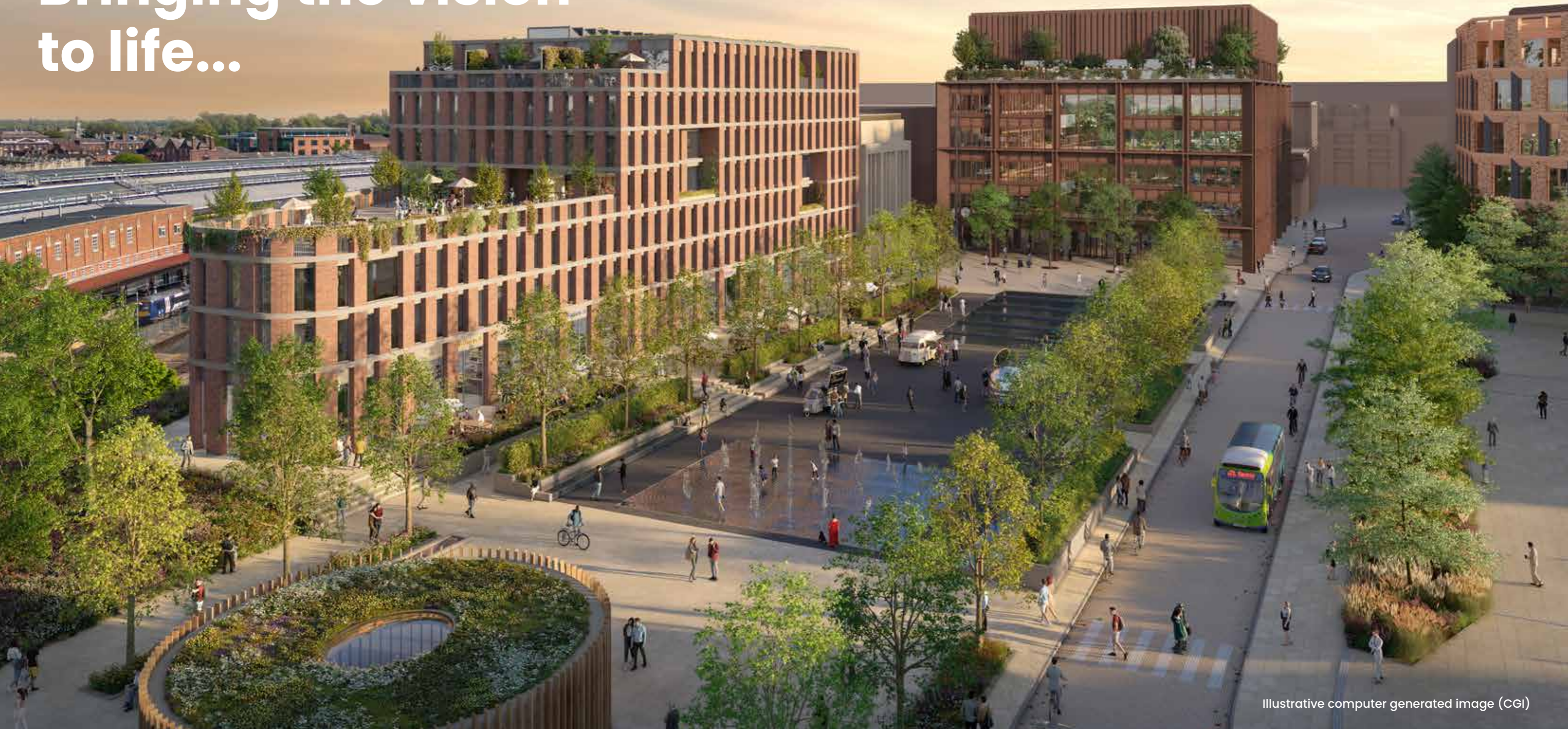
Illustrative computer generated image (CGI)