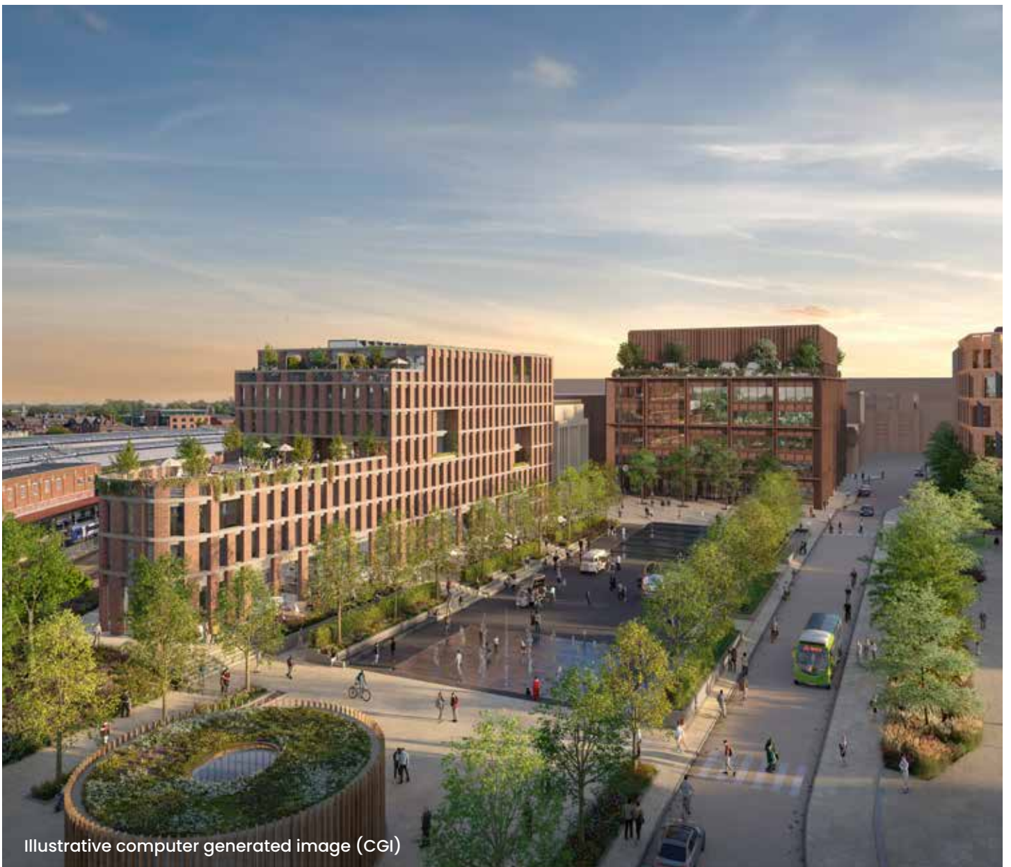
Illustrative computer generated image (CGI)